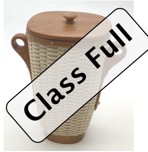
Su-3 Sun 8-2 Eric Taylor Mid-Century Cotton 5½”H x 3½”L x 3½”W $150/Int•6 hours

Students will weave over a double walled stainless coaster. A cherry rim will be glued on this Nantucket treasure. Students will have a choice of various custom accent options. Teacher will provide all tools.