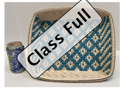
Sa-3 Sat 8:30-5:30 Peggy Adelman Tiny Diamonds 2½”H x 11”L x 9½”W $65/Int•8 hours

Perfect for a weekend adventure! The center design is woven with dyed Hamburg cane, the rest with reed. The optional beads are under the rim. The rim is the same leather as the handle and is lashed with waxed linen.