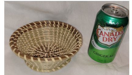
Su-11 Sun 8-12 Barbara McCormick Candy Dish with Base Size Varies $75/All•4 hours

Students will learn to set up and weave a Nantucket using cane stakes and weavers. Basket woven over a tin class mold. Handle attached with bone knobs and a little shovel is tied on to accent the little pail. Cherry base, rim, and handle. Tools provided.