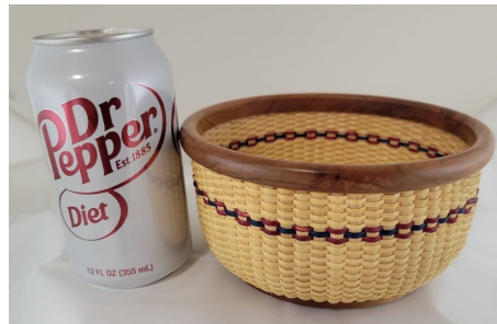
F-2 Candy Barnes Little Bit of Color 3½"H x 5½"D $70/Beg•6 hours

This fun tree is woven starting with a styrofoam form attached to a 4" base. Hamburg cane is used as a weaver and 2 spirals are woven in. A clay topper and fused glass and copper star sit atop the tree. Red beads are placed forming the lights.