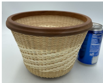
Sa-6 Sat 8:30-5:30 Jan Beyma Southern Biscuit Basket 6”H x 8”D $90/Beg•8 hours

Begin on a racetrack base with natural reed spokes and smoked reed triple twine. Insert multi colored FO spoke overlays, finish with traditional lashed rim. The figure 8 weave in smoked reed is added when basket is complete. BRING: 60 quilter/micro clips and small bent tip packing tool.