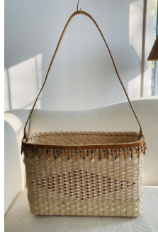
Sa-2 Sat 8:30-5:30 Kathy Petronzio The Weekender Tote 11”H x 15”L x 5”W 26”H w/handle $85/Int•8 hours

“Brush” is woven over a plastic shell that becomes a permanent feature of your basket. This basket is woven with black ash and includes a cherry wood base, rims and lid. All materials are personally made by Eric. Brush is one of three of the Mid-Century Vanity set.