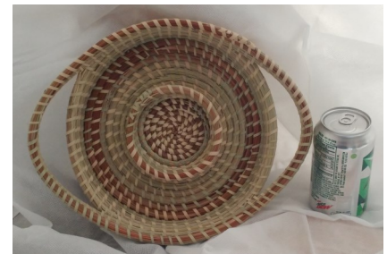
Sa-7 Sat 8:30-5:30 Barbara McCormick Sweetgrass Chip & Dip Size Varies $95/All•8 hours

Students will insert cane staves into the base and begin weaving over/under, then change to a twill with hamburg cane, finishing with cane over/under. Woven over a plastic class mold, base and rim are pre-finished mahogany. Tools provided.