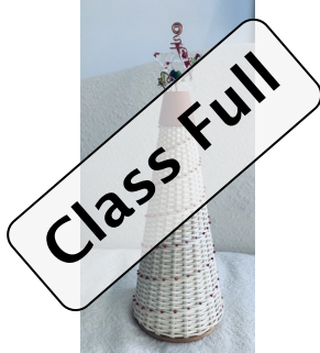
F-1 Kathy Petronzio Holiday Tree 13"H x 4"D $85/Int•6 hours

This fun tree is woven starting with a styrofoam form attached to a 4" base. Hamburg cane is used as a weaver and 2 spirals are woven in. A clay topper and fused glass and copper star sit atop the tree. Red beads are placed forming the lights.