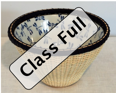
Su-5 Sun 8-2 Kathy Petronzio Japanese Bowl 5”H x 6”D $65/Beg•6 hours

Traditional weaving methods are used to create Meadow Lane. The 12” sq hoop is not included while weaving the basket. The rim brings the basket and handle together creating a distinctive look. A variety of colorful liners will be available.