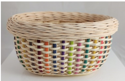
F-4 Pam Milat Prissy 4"H x 7½"L x 5½"W $55/Int•6 hours

Coiled with Sweetgrass and Southern long-leaf pine needles, lashed with palmetto, techniques taught will enable students to design a variety of shapes and sizes. BRING Scissors, no water. Additional tools provided.