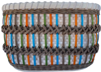
Sa-5 Sat 8:30-5:30 Mary Price Infinity 7”H x 11”L x 7”W $85/Int•8 hours

This basket is woven from ¼” flat dyed and natural reed. The twill pattern forms diamond shapes offset in each row. Sides are a 2x2 twill with natural reed. It’s possible the rim will need to be finished at home. Color options will be available. A nice basic twill!