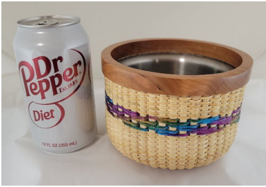
Su-1 Sun 8-12 Candy Barnes Wine Coaster 3½”H x 5”D $70/Beg•4 hours

Students will weave over a double walled stainless coaster. A cherry rim will be glued on this Nantucket treasure. Students will have a choice of various custom accent options. Teacher will provide all tools.