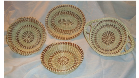
F-3 Barbara McCormick It's Your Sweetgrass Basket Varies $85/All•6 hours

Students will insert tapered staves in a cherry base and will weave with cane over a class mold. A cherry rim will be glued on. Students will have an option of being creative with color option provided. Teacher will provide tools.