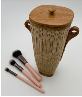
Sa-1 Sat 8:30-5:30 Eric Taylor Mid-Century Brush 7½”H x 3½”L x 3½”W $165/Int•8 hours

“Brush” is woven over a plastic shell that becomes a permanent feature of your basket. This basket is woven with black ash and includes a cherry wood base, rims and lid. All materials are personally made by Eric. Brush is one of three of the Mid-Century Vanity set.