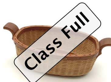
F-5 Eric Taylor Cottage Tea 2"H x 7"L x 3¾"W $110/Int•4 hours

Woven on a wooden racetrack base, students will have an array of dyed pieces to place as preferred. Techniques: 3-rod wale, overlays, twill weave, twining and finish with a Gretchen rim. Some will leave after completing multiple rim rows, with instructions to finish. BRING 36 quilter/micro clips.