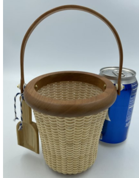
Su-10 Sun 8-12 Jan Beyma Little Sand Pail 9”H w/handle x 4½”D $85/All•4 hours

This lovely Japanese bowl has a 3” attached wood base. The spokes are reed and the weaver is hamburg cane. The rim is dyed indigo blue and is attached with waxed linen. Nantucket techniques are taught. Bowl comes in a variety of Japanese inspired designs.