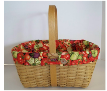
Su-4 Sun 8-12 Marilyn Wald Meadow Lane 5½”H x 15”L x 12”W $55/Int•4 hours

“Cotton” is woven over a plastic shell that becomes a permanent feature of your basket. Woven with black ash and includes a cherry base, rims and lid—all personally made by Eric. This is one of three basket that comprise the Mid-Century Vanity Set.